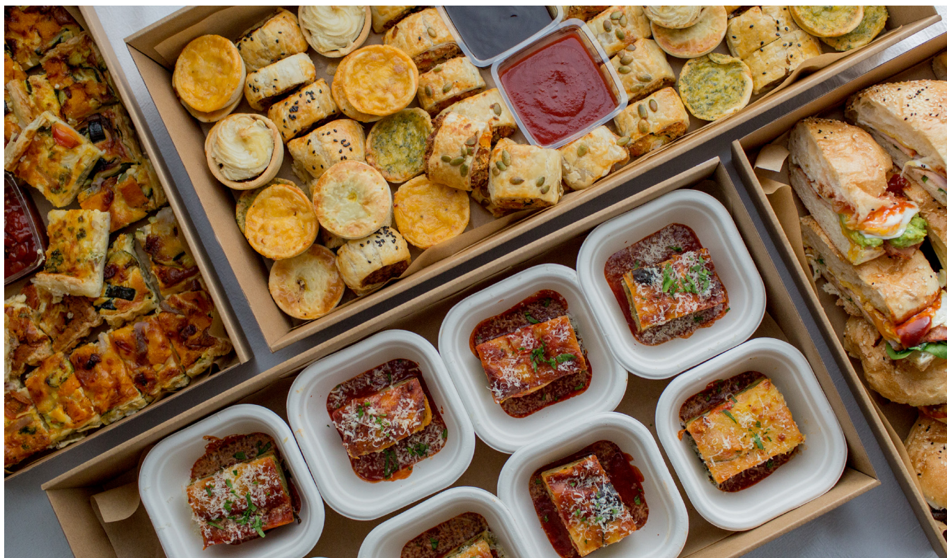
Mixed Selection of Hot Food