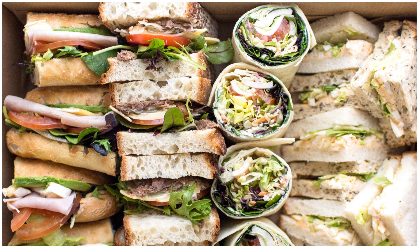
Mixed Sandwich Box