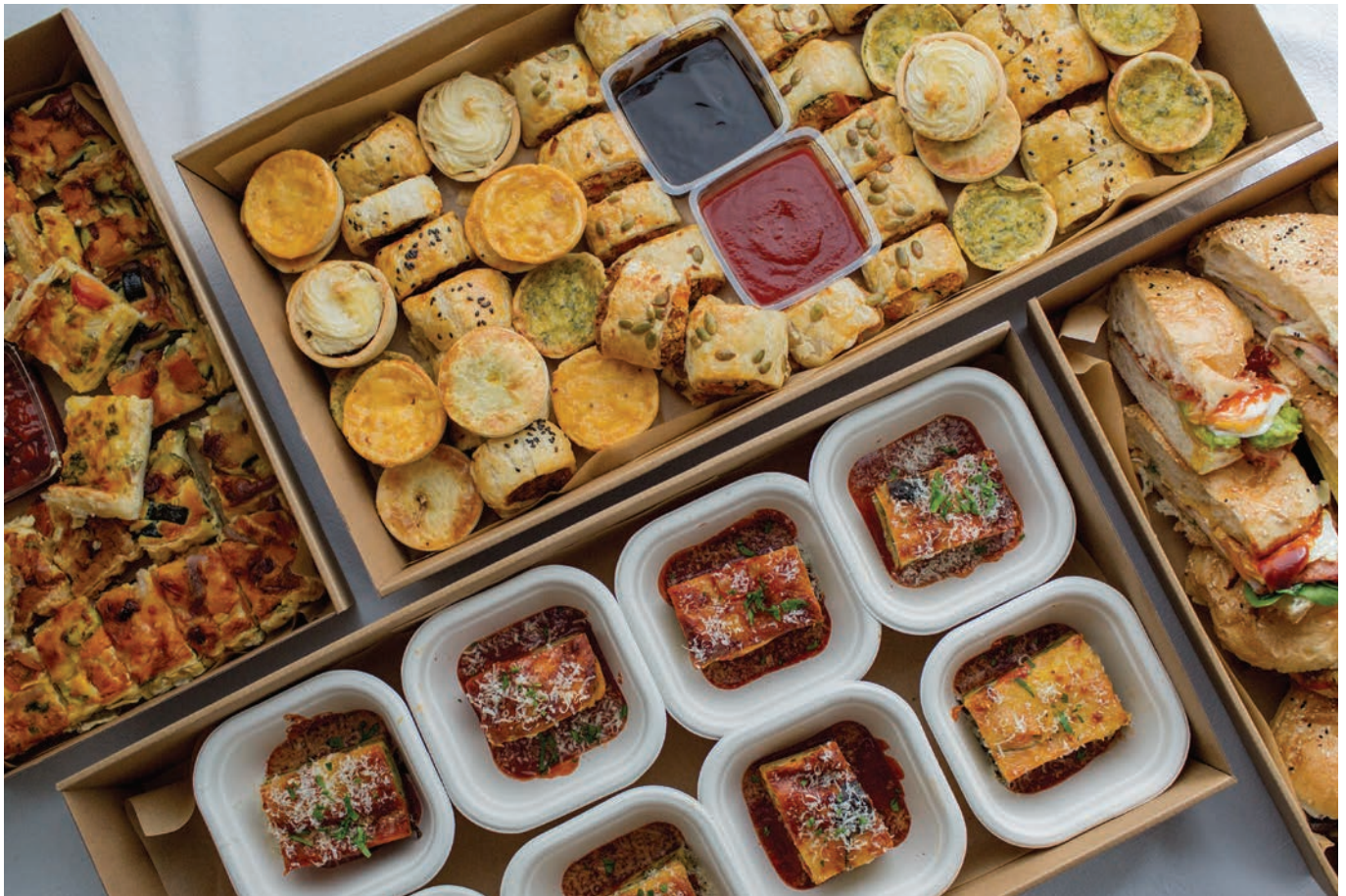
Mixed Selection of Hot Food