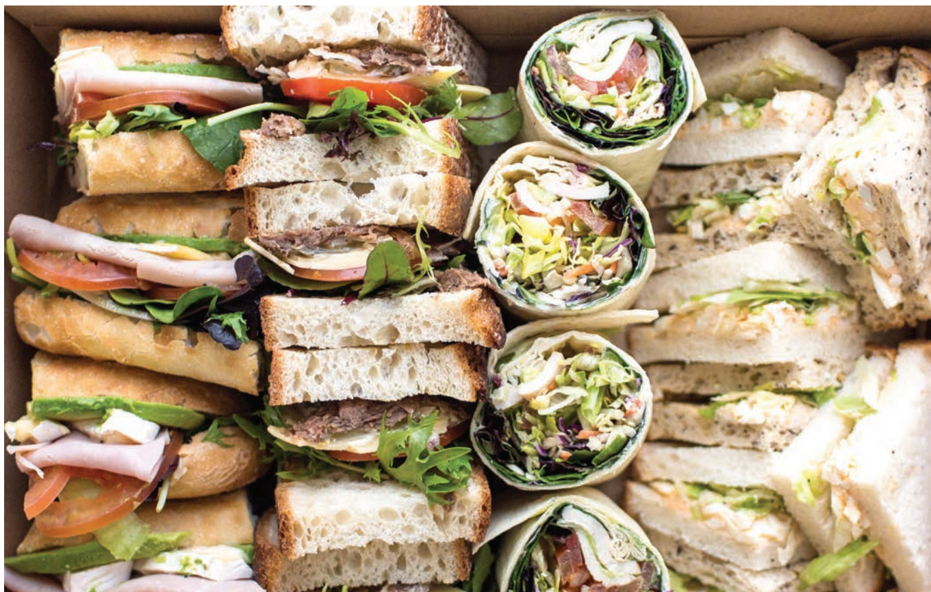
Mixed Sandwich Box